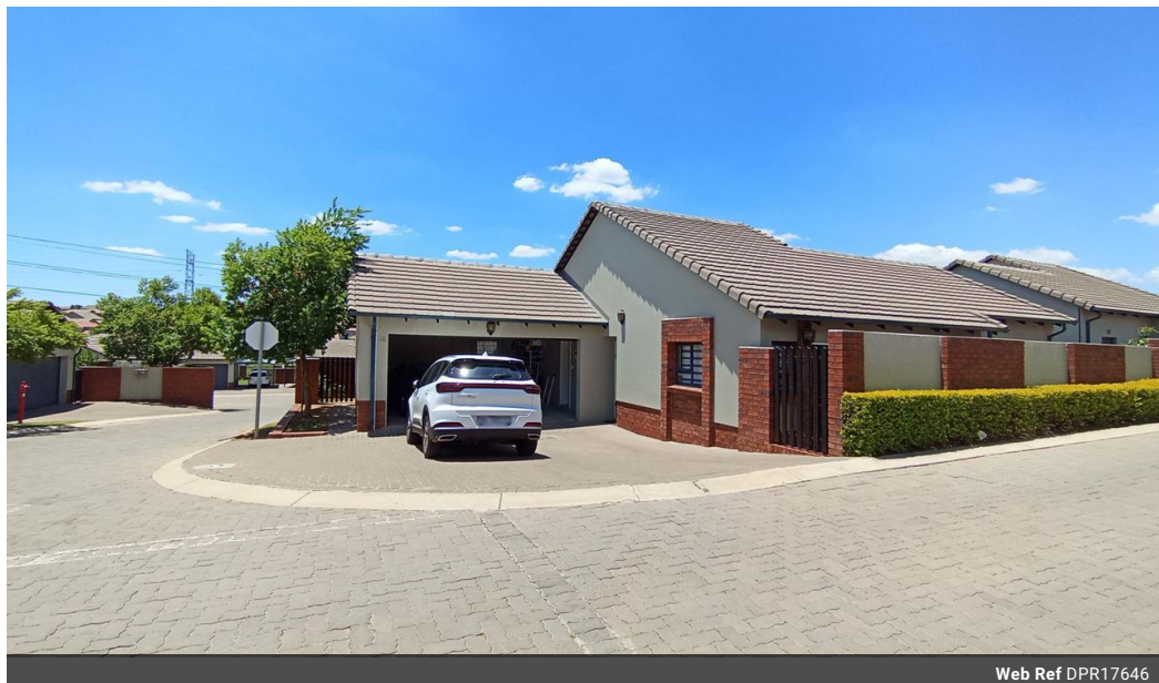
Web Ref DPR17646